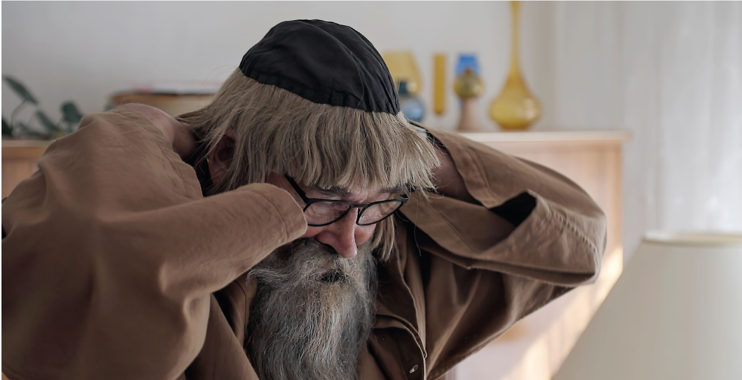
extract "Mönchszüge – invented traditions part two" https://vimeo.com/432508674/d2504798bd

1 invented tradition [Hobsbawm, Eric & Ranger, Terence, The Invention of Tradition , 1983]