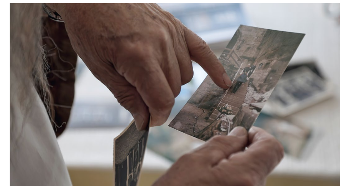
"Mönchszüge - invented traditions part two" full HD, 22 min, film stills, 2019