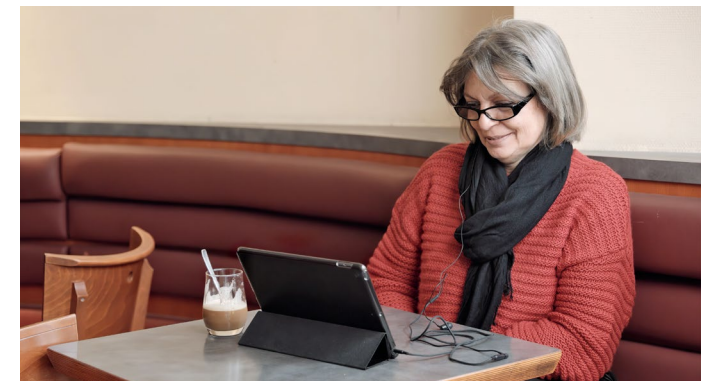
"Family Business" full HD, film stills, 2021