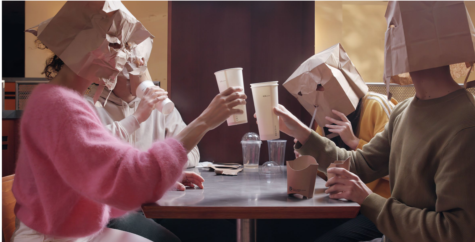
extract "children's birthday party" (14 min) https://vimeo.com/622434504/fd72a3b6ec