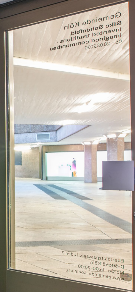
One Percent – imagined communities installation view "invented traditions / imagined communities" Gemeinde Köln, Ebertplatz Passage, Cologne, March 2021