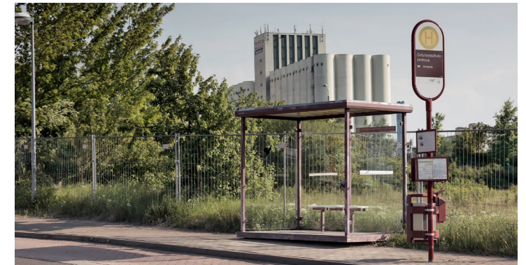
"One Percent – imagined communities" full HD, 8 min, film stills, 2019