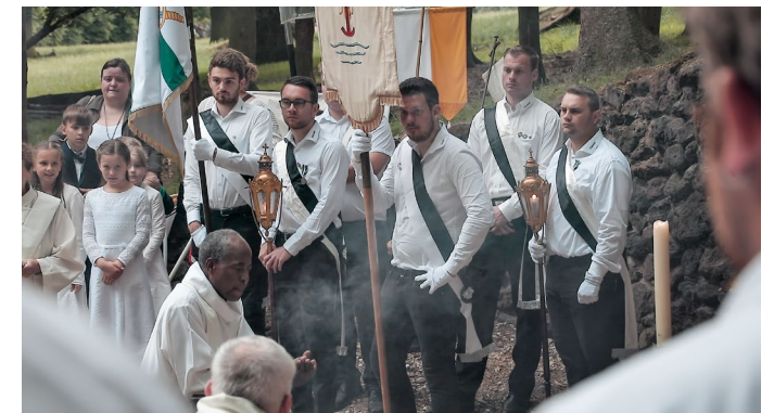
“Mainacht - invented traditions part one” full HD, 35 min, film stills, 2019