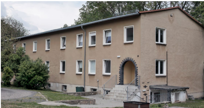
extract "One Percent – imagined communities" https://vimeo.com/313542144/d6ff25afb4