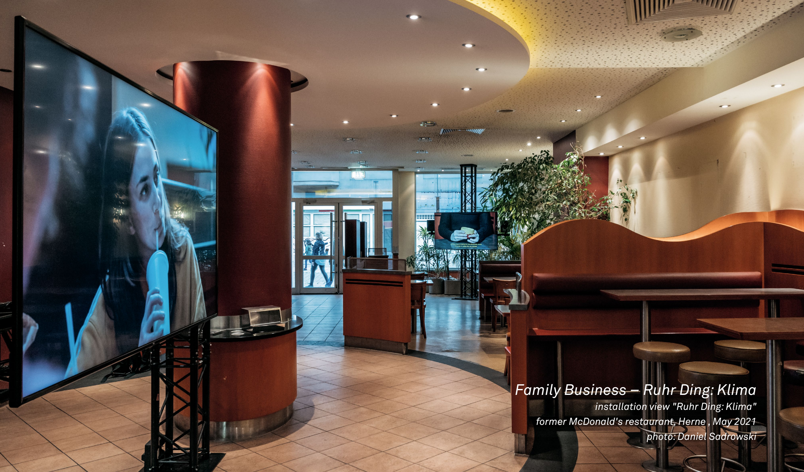
Family Business — Ruhr Ding: Klima installation view "Ruhr Ding: Klima" former McDonald's restaurant, Herne, May 2021