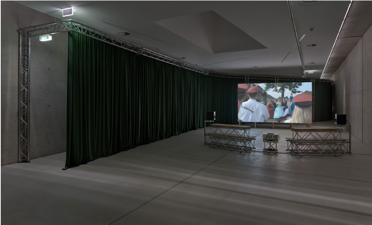
“Mainacht - invented traditions part one” installation view, KIT – Kunst im Tunnel, photo: Ivo Faber

Religious and secular traditions are intertwined. Through an ethnological and empathetic perspective on a domestic tradition questions about common values and certainties are raised.